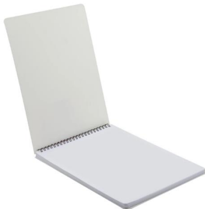
Plain A4 sketch-pad Computer Science

Example of the plastic folder for Science/French/Spanish/Computer Science